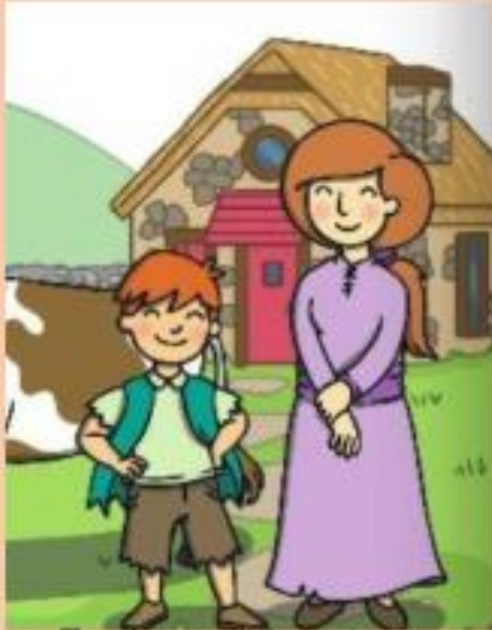
Jack and his mum are poor and live on a small farm.

Have a look at your plan from last week. How are you going to start your story?