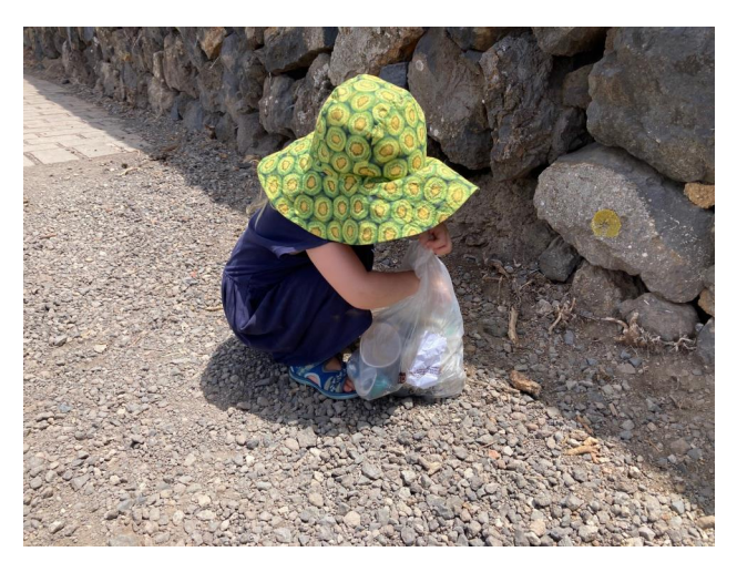
1 - River Juno helping to keep the environment tidy and rubbish-free!