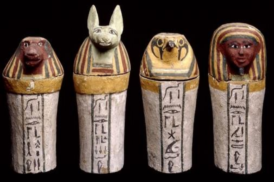
The British Museum

These are the Canopic Jars we are going to focus on today, which today can be found in The British Museum, London.