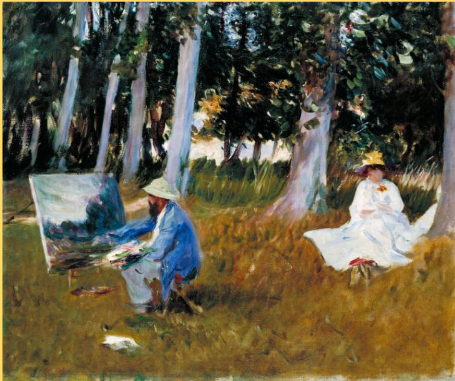
John Singer Sargent Claude Monet Painting by the Edge of a Wood 1885