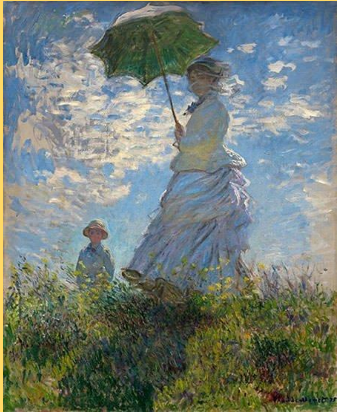
Women with Parasol, 1875.