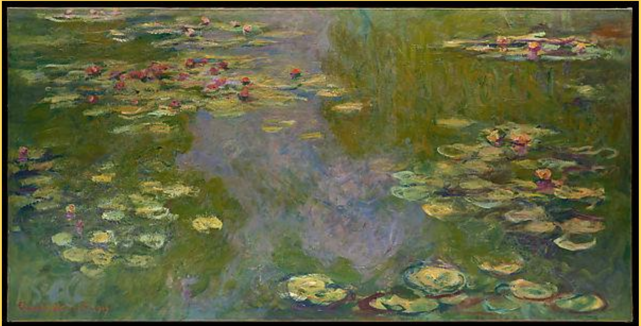
Water Lilies, 1919 – inspired by the same landscape.