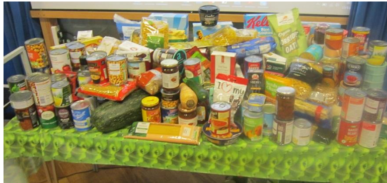
All donations have gone to Lewes Foodbank – thank you