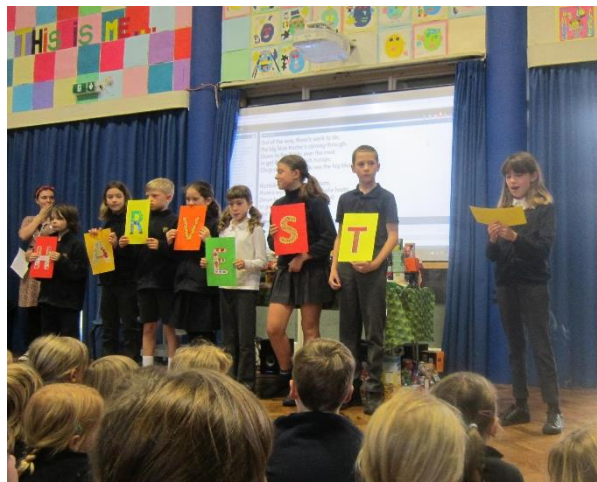
Year 6 leading our Harvest Festival celebrations